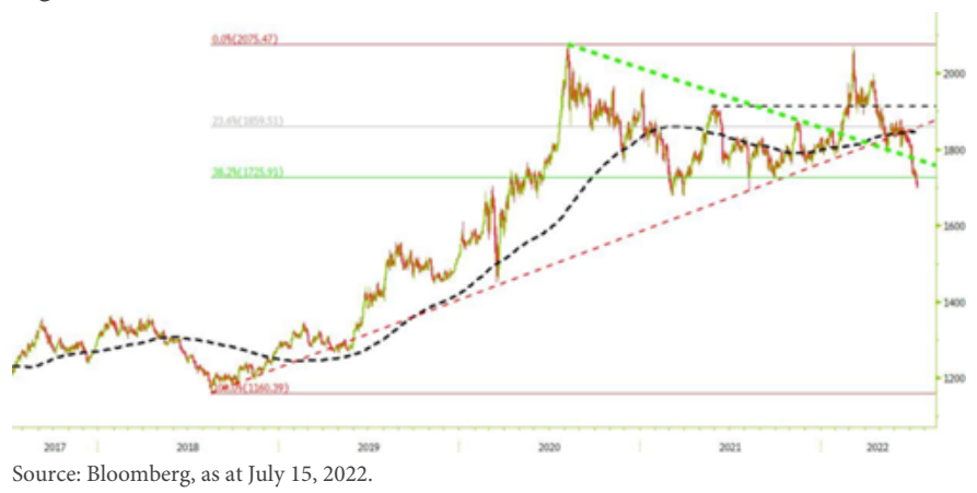
Figure 3: Price of Gold