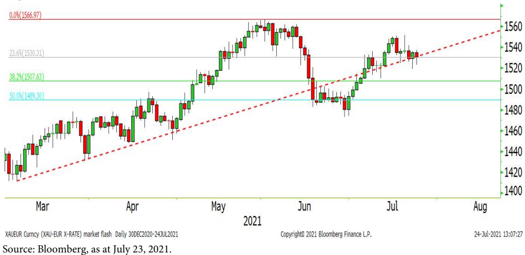
Figure 4: XAU/EUR

"Technically, XAU/EUR prices have found support at 1530 following a technical pullback."